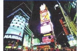
Journey to electrifying Times Square