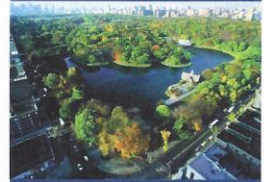
Visit famous Central Park