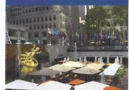
Explore amazing Rockefeller Center